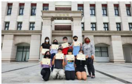
Computer Vision and Face Recognition Workshop – collaboration with Robomy Sdn. Bhd.