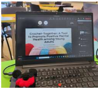
Final Year Project Presentation by SWE Student