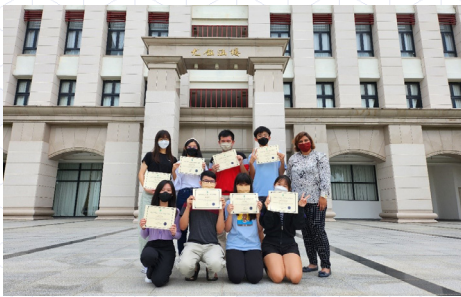
Computer Vision and Face Recognition Workshop – collaboration with Robomy Sdn. Bhd.